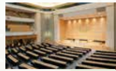
ASSEMBLY HALL Building A - 3 rd Floor