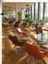
SERPENT BAR Receptions area Building E 1 st Floor