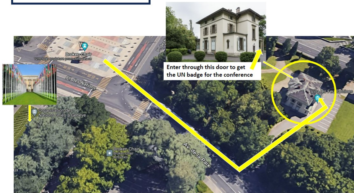
Map 1: directions to Villa les Feuillantines

(Additional information is provided on the next page).