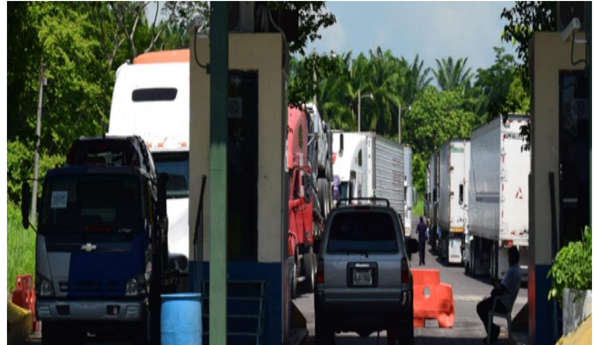
Long delays at check points