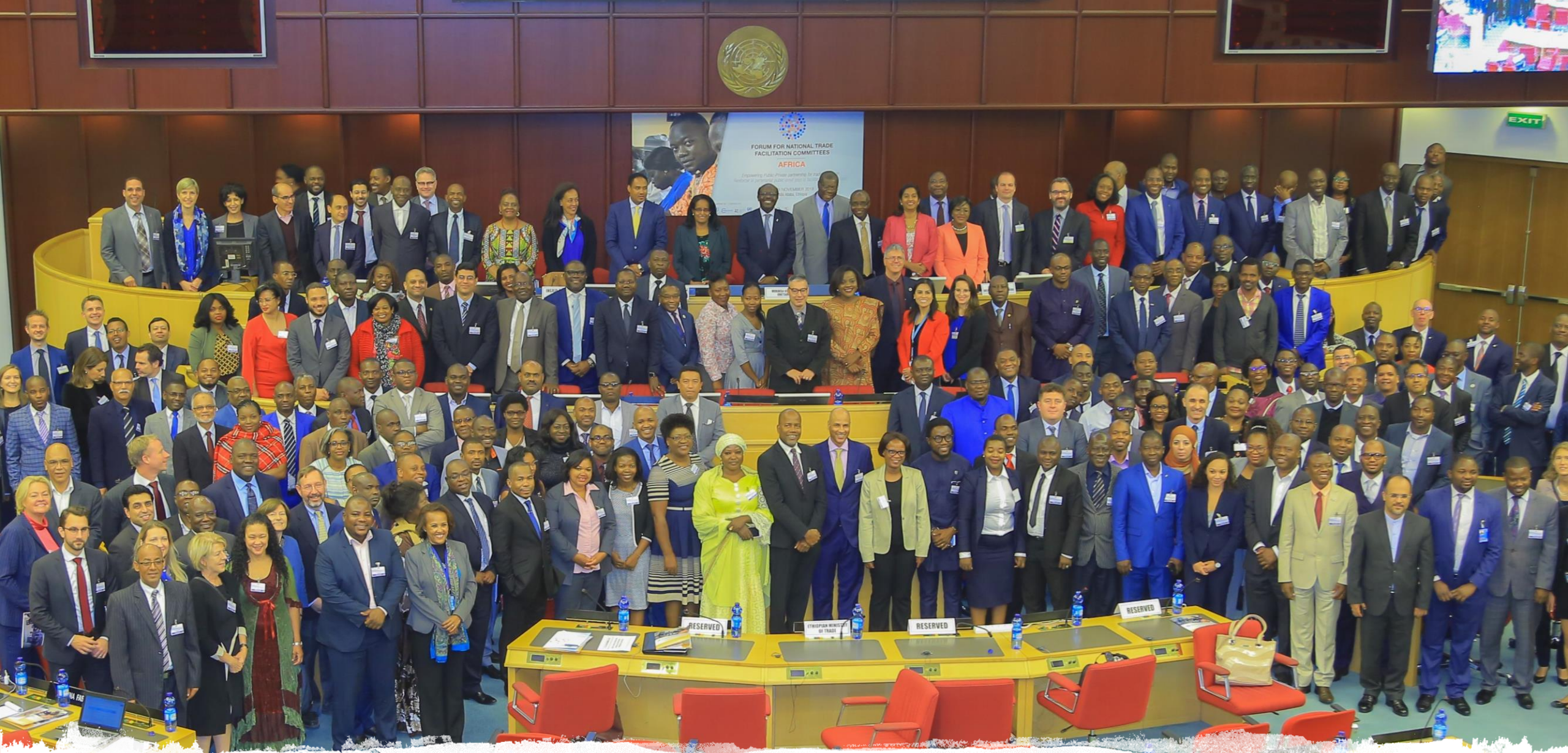
Participants at the First African Forum for National Trade Facilitation Committees