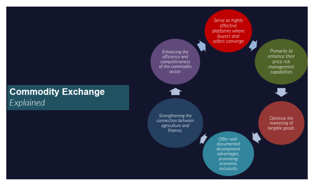
Figure 2. Commodities Exchanges Explained

grow; it also makes a big contribution to the overall economic progress of the countries where these exchanges are active.