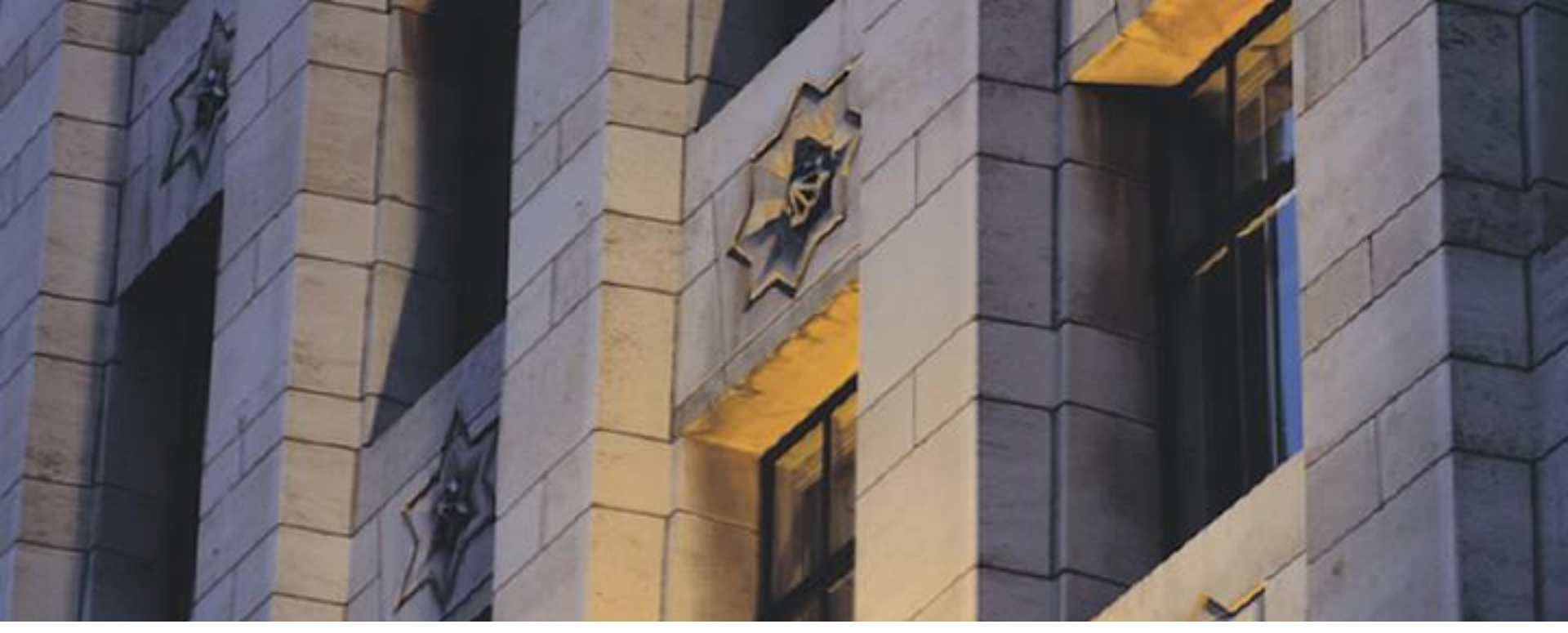
14<sup>th</sup> Intergovernmental Group of Experts on Competition Law and Policy

Round Table on: Informal Cooperation among Competition Agencies on Specific Cases