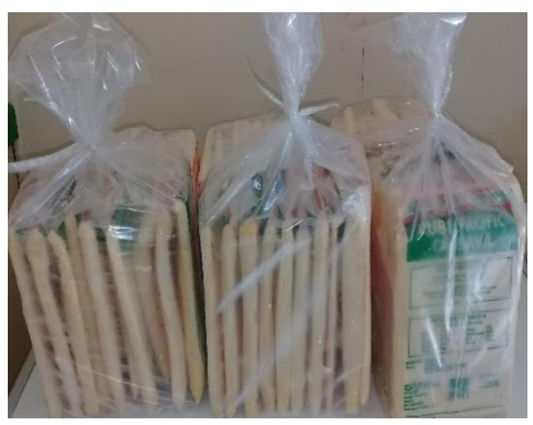
10kg Cassava Grated