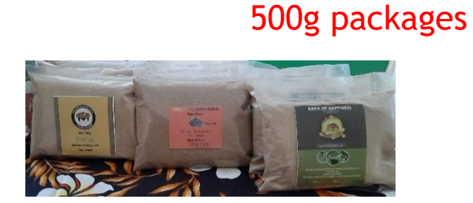
100g packages (Local Sales