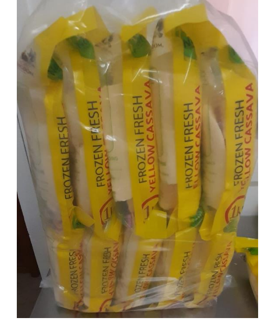
10kg Yellow Cassava bag