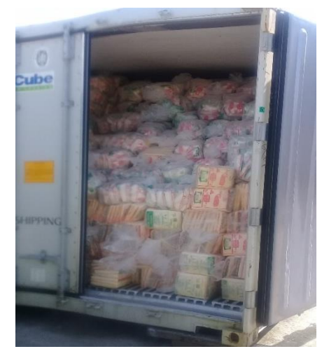
10kg Cassava Grated bags Filled with bags of Frozen cassava