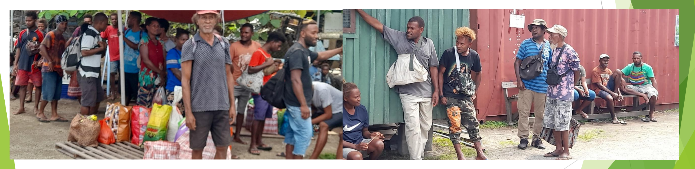
Most Thavakua farmers waiting for their payment as VHL Accounts sort out their payment the same day.