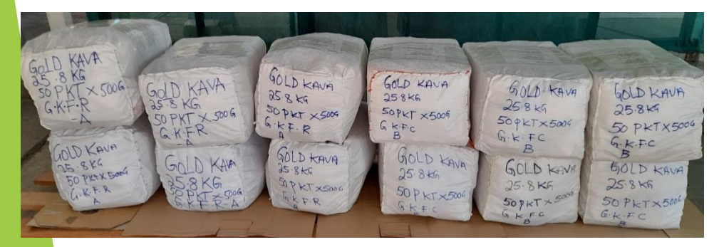
25pkts x 25kg bags of Thavakua powder