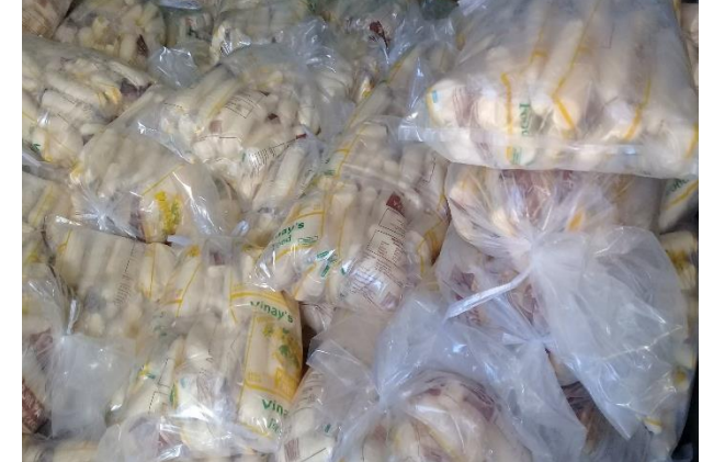
10kg Cassava bags