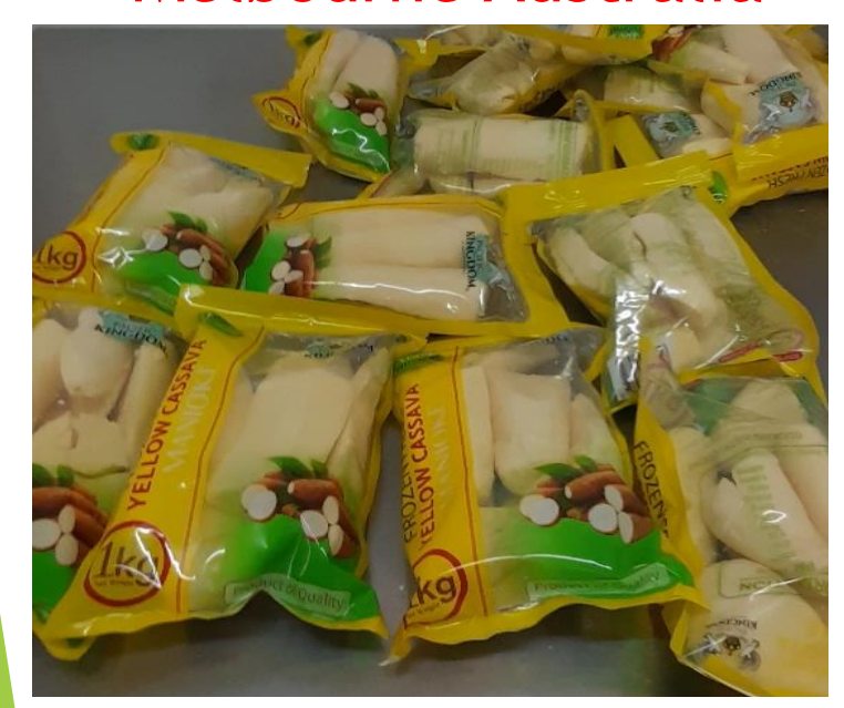
1kg Yellow Cassava Packets