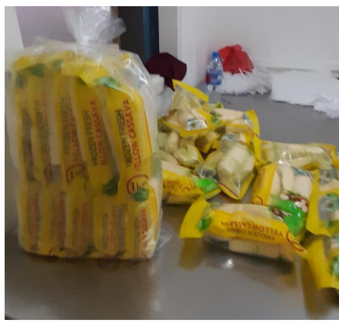
10kg Yellow Cassava bag