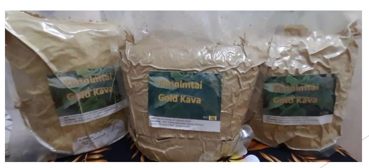
1kg & 500gms packages(Kiribati)