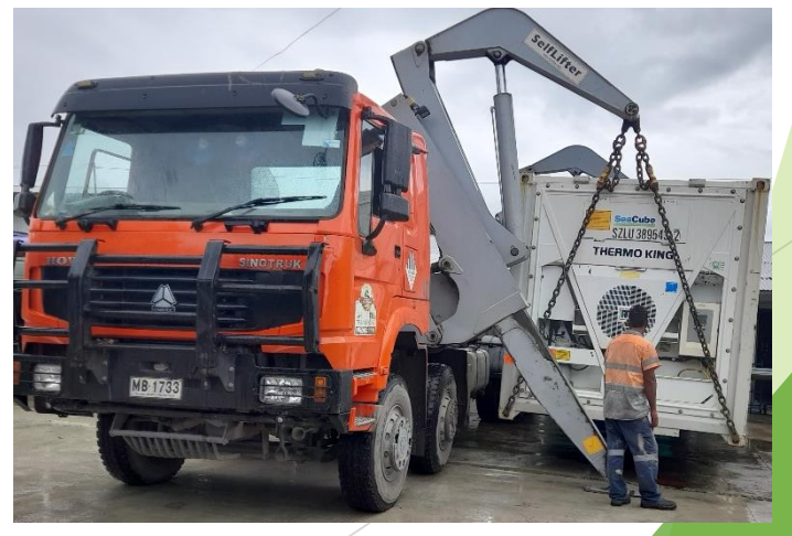
Reefer Container left to Port