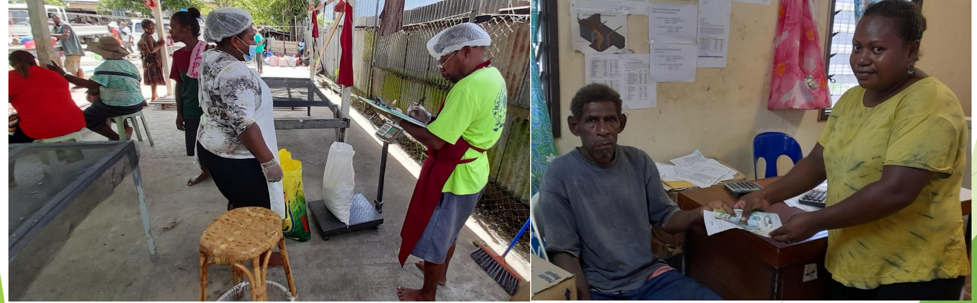
Scaling of farmers well dried Thavakua

Grading of Dried Thavakua to quality control Resundrying to meet require moisture content