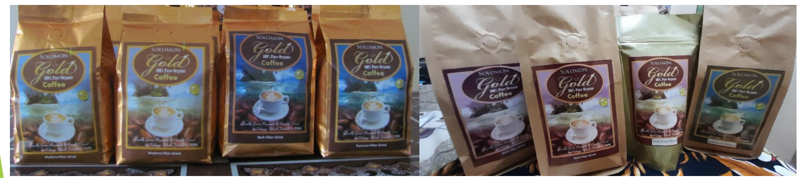
250gm Dark Roast Grind Coffee