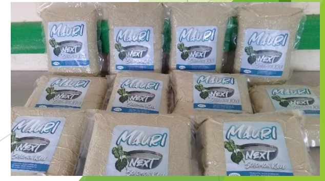
500g packages (Kiribati)