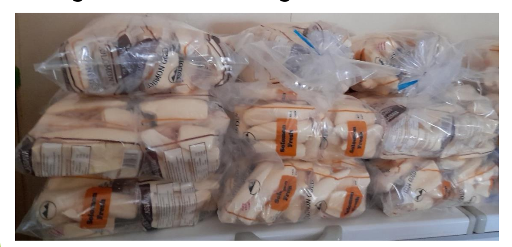
10kg Yellow Cassava bags