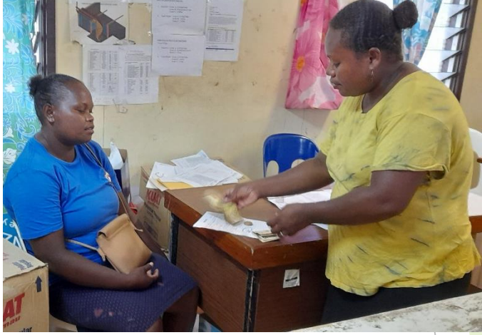
Thavakua farmers received their payment from VHL Accounts Office