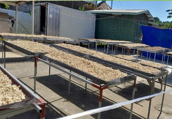
Re-sun drying to meet required Moisture Content