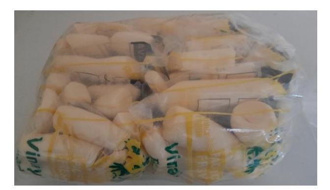
10kg Yellow Cassava bag