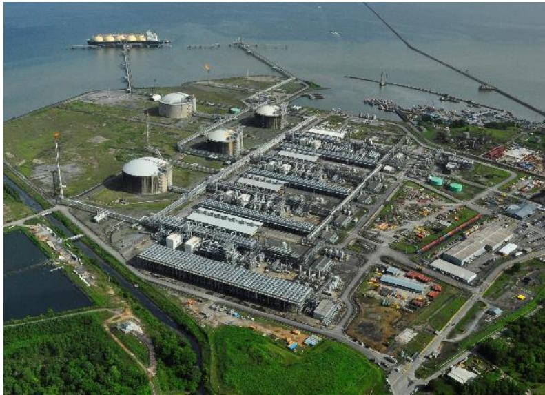
Low carbon LNG