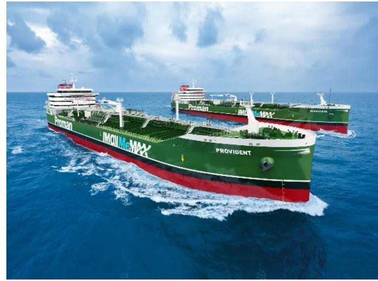
Alternative maritime fuels