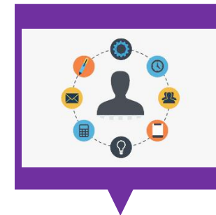
PROJECT & CHANGE MANAGEMENT