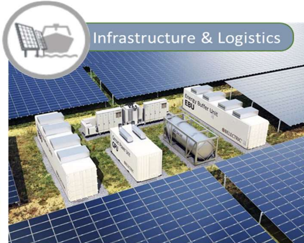
Infrastructure & Logistics