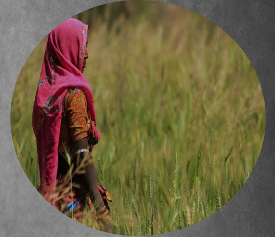
Trade and Gender