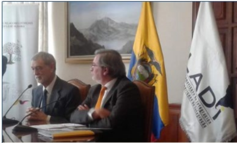
Visita del Secretario General de la ALADI al Ecuador