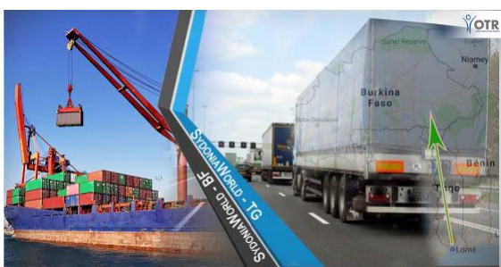
Le transit régional a officiellement démarré!

Depuis le 11 mai 2018, les transits au départ du bureau des hydrocarbures de Lomé (TG 124) à destination du bureau de Bingo Burkina (BF C05) sont enregistrés sur le système Sydonia World de la douane togolaise et transmis automatiquement au Sydonia World burkinabé.