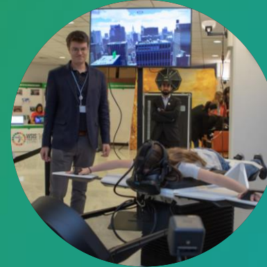
Exhibition spaces showcasing latest technologies