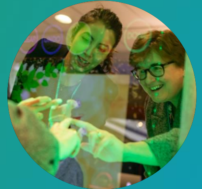
WSIS Special Innovation Prizes