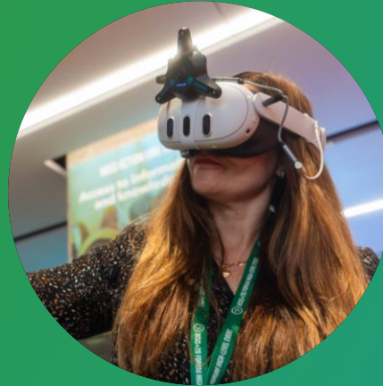
AI for Good and WSIS Forum organized concurrently