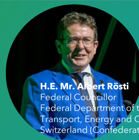
H.E. Mr. Albert Rösti Federal Councillor Federal Department of the Environment, Transport, Energy and Communications Switzerland (Confederation of)

"WSIS Plus" a strengthened and further developed inclusive framework for digital governance and cooperation which will be fit-for-purpose and serve us well as we enter an era of fast and uncertain AI and digital developments.