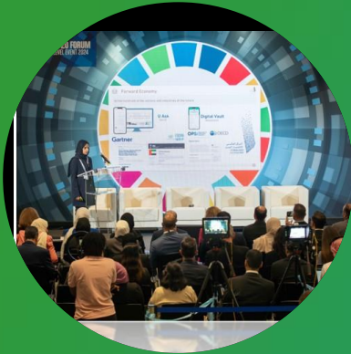
WSIS Forum agenda and programme continuously updated to encompass discussions on new and emerging technologies