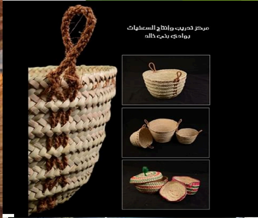
مركز تدريب وإنتاج السعفيات روادى بنج خالد