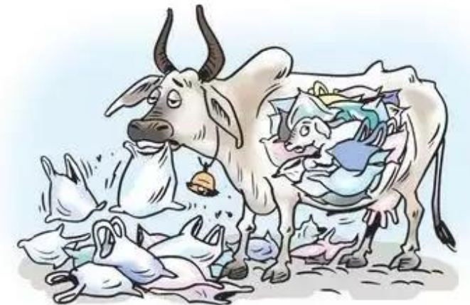
YOUR NYAMA CHOMA