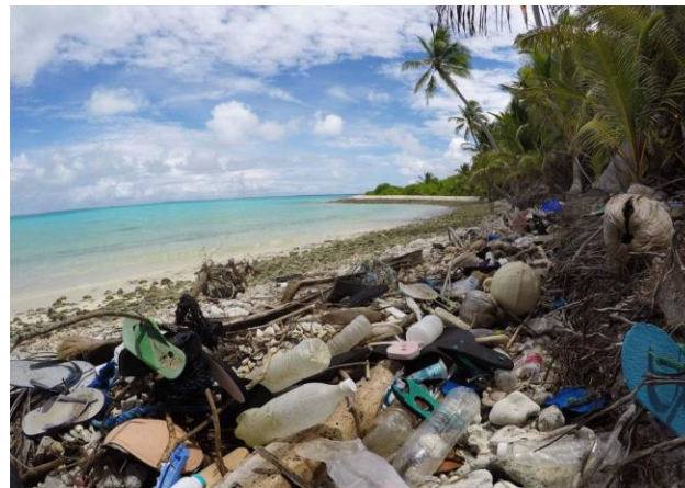
INDIAN OCEAN COAST