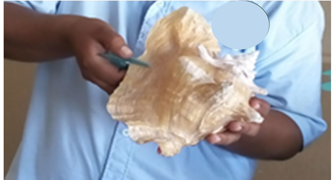
Measurement of queen conch shell lip thickness using a Vernier caliper

The shell lip thickness (measured at the mid-lateral region on the lip side of the shell) is measured to the nearest 0.1 mm using a Vernier caliper