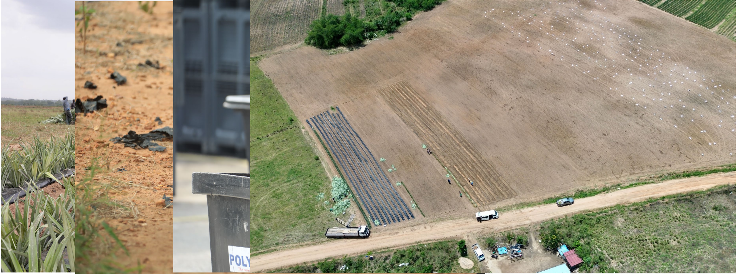
Bio-mulch and mulch lifting trials in Ghana (linked to BlueSkies supply chain).