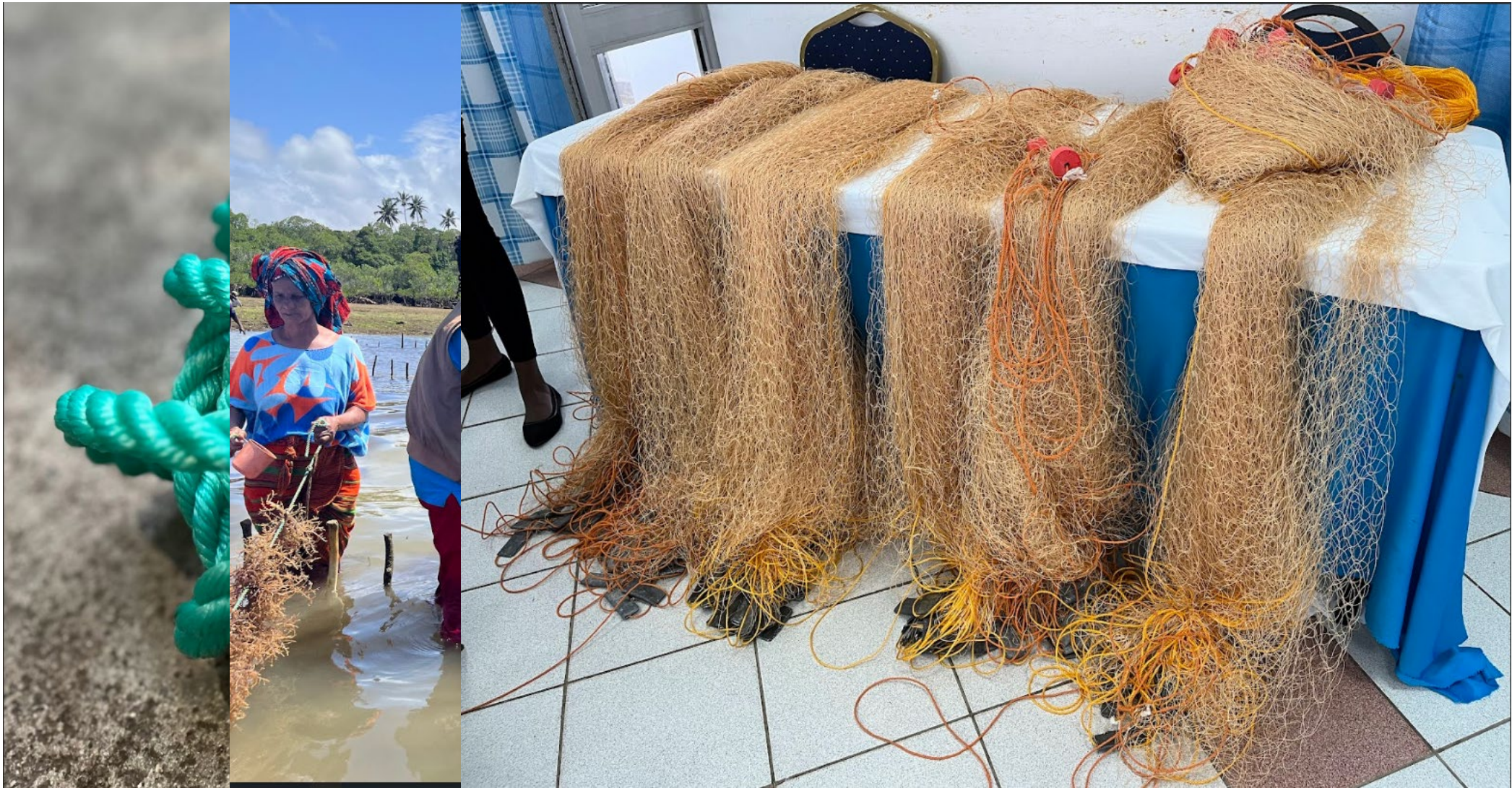
Biodegradable fishing gear and ropes (Sweden / South Africa / Kenya)