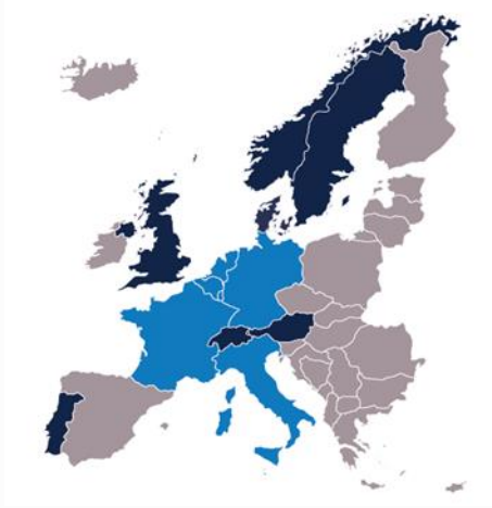
EFTA and the EU 1960

The promotion of trade and economic integration to the benefit of its Member States and their trading partners around the globe.