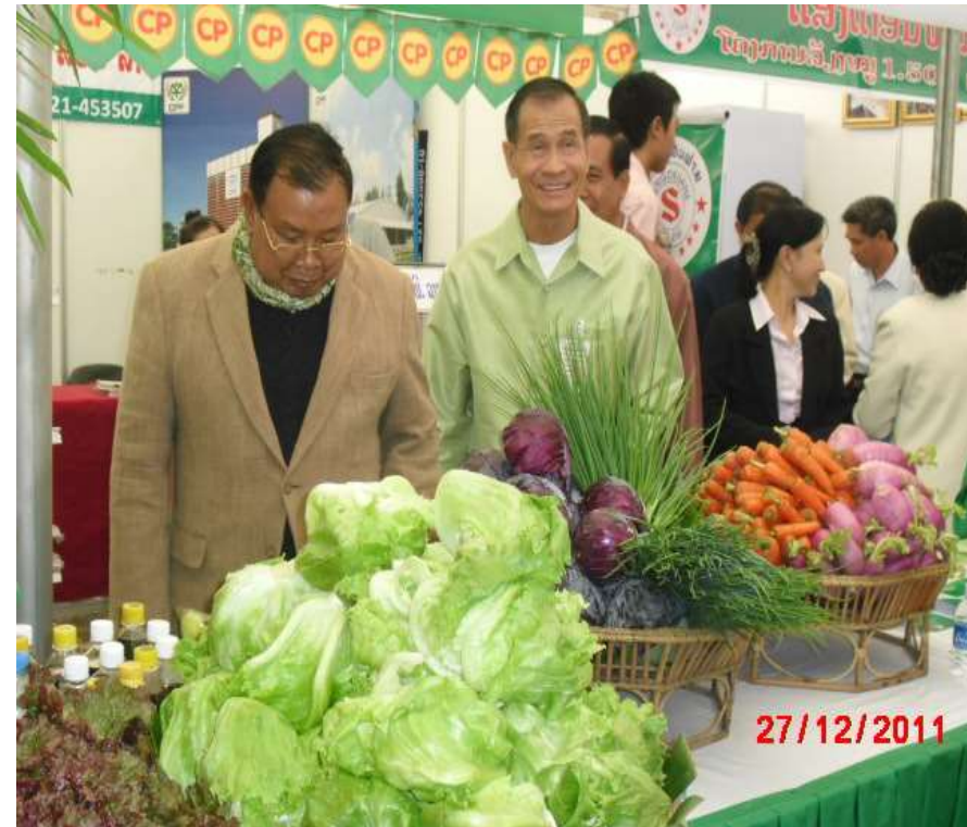
Vice-President of Lao PDR, Mr. Bounyang VORRACHIT, visited Organic Fairs