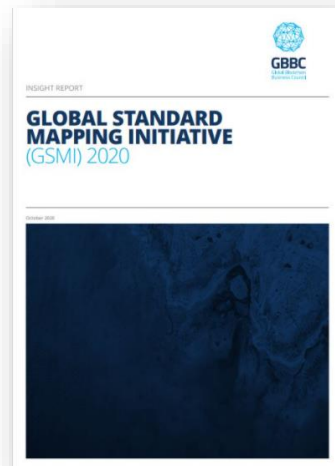
Legal & Regulatory Report

GSMI 1.0 FINDINGS AND ANALYSIS ORGANIZED AS: