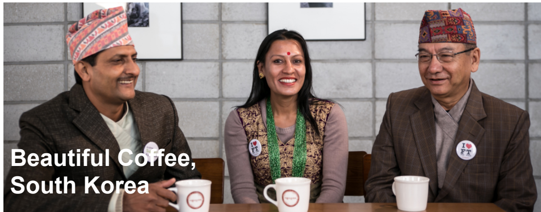
Beautiful Coffee, South Korea