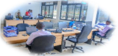
Clearing & Forwarding