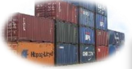
Inland Container Terminal