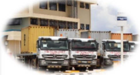
Long & short haul Transport