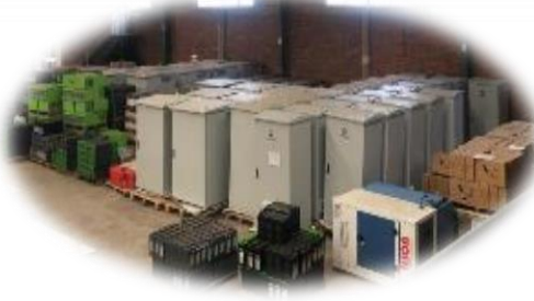
Non-Bonded Warehousing Supply Chain