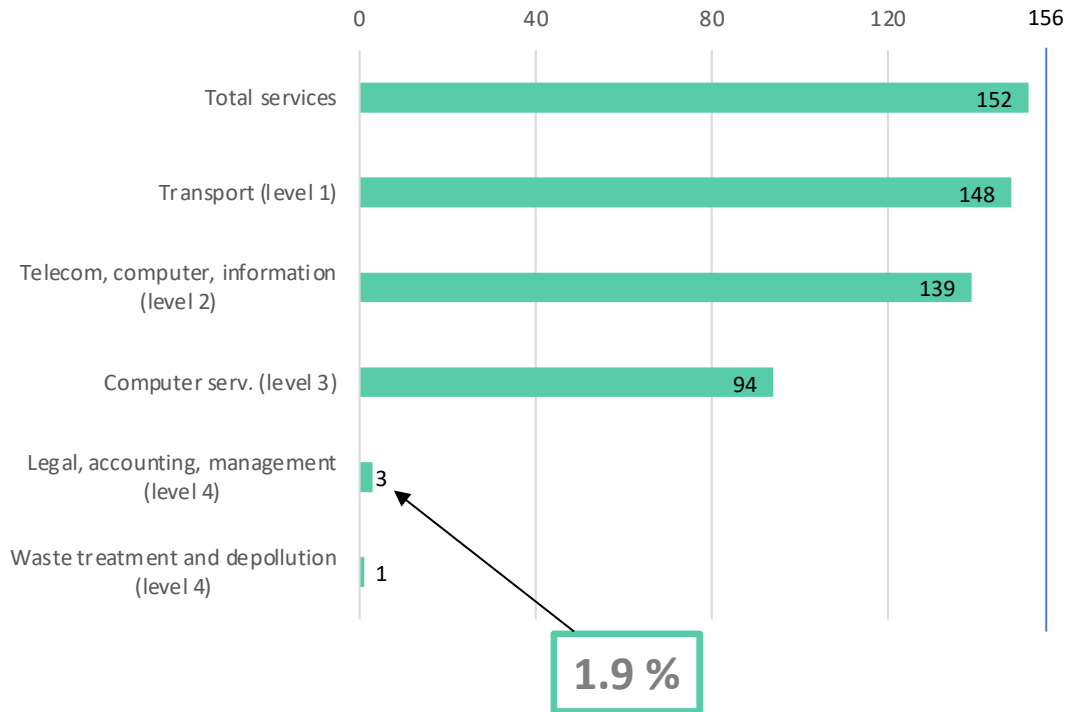
Number of developing economies reporting exports in selected service categories (for year 2017; max = 156)