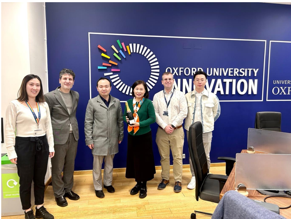
Celebrating the official establishment of OxValue.AI, a spin-out from TMCD