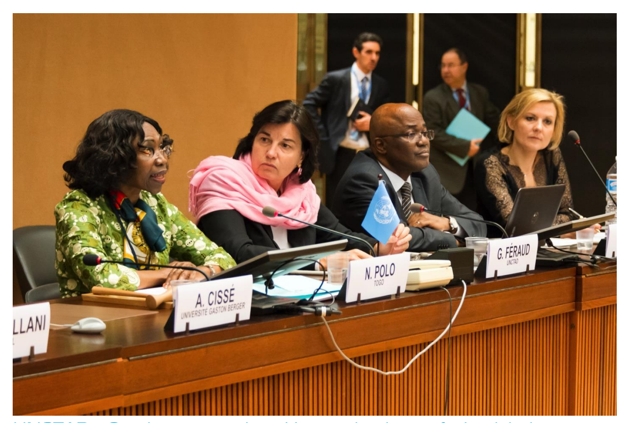
UNCTAD Seminar on the Harmonisation of Legislation on Electronic Commerce within ECOWAS

Under the UNCTAD project to assist countries in the ECOWAS region to develop harmonised legislation on electronic commerce, the Division on Technology and Logistics organised a regional seminar from 23-24 March 2015 in Geneva as part of the UNCTAD E-Commerce Week.