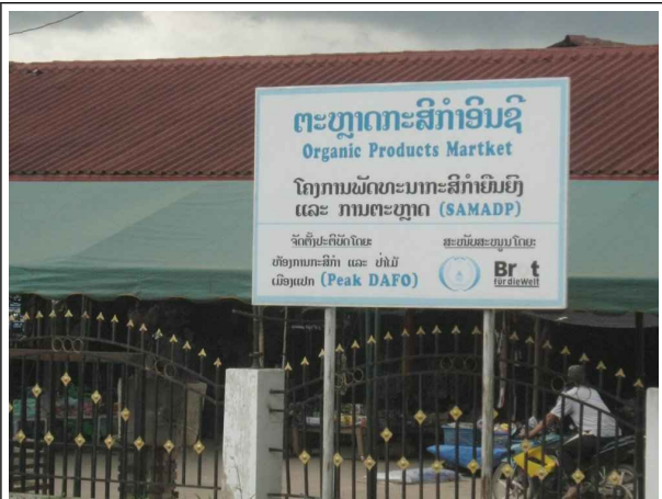
Farmer market in Xieng Khuang