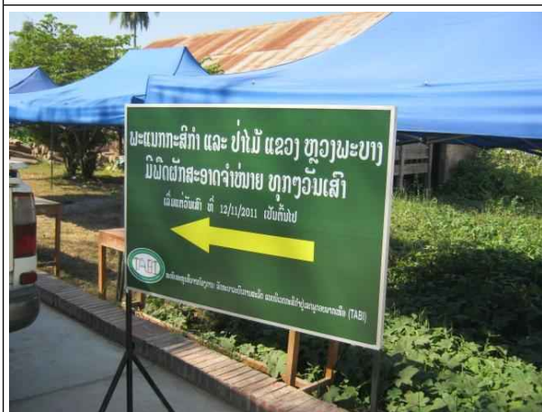
Farmer market in Luang Prabang