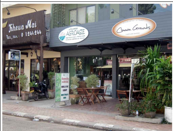
AgroAsie Shop in Vientiane