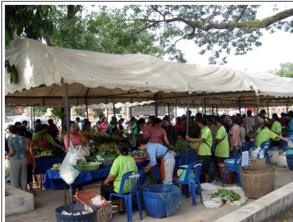
Weekend organic market in Vientiane

freshly ground organic coffee to take home. No restaurant makes a formal claim of an organic menu but some restaurants in Luang Prabang do serve foods made from non-certified organic produce.