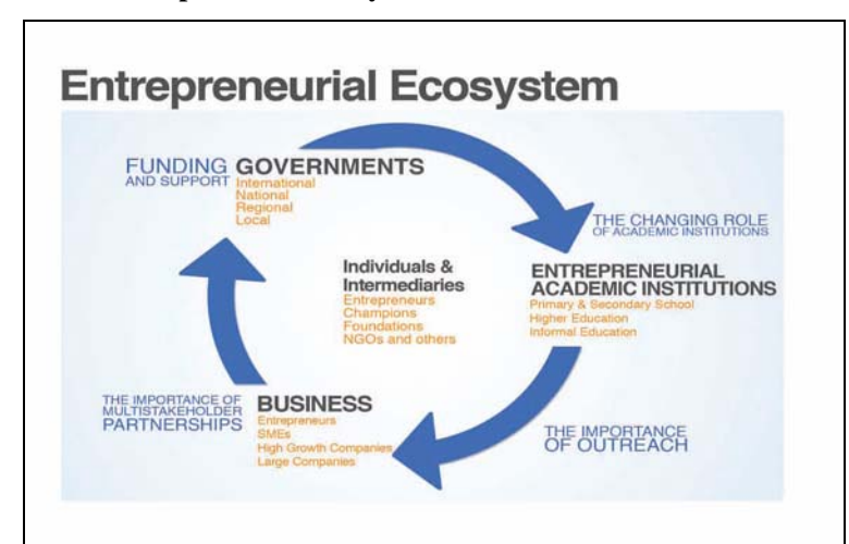
Figure 1. The entrepreneurial ecosystem