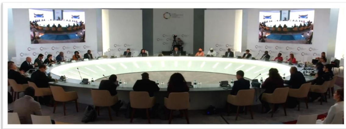
Empretec directors from Argentina, Brazil, India, Uganda and Zimbabwe attended GES VI together with experts from Bahrain and Saudi Arabia

This year's Empretec Global Summit: Fostering Entrepreneurship Mindset Towards Inclusive Growth was organized by UNCTAD on 16 April 2019 within the context of the Global Entrepreneurship Congress (GEC) held in Bahrain. Empretec directors from Argentina, Brazil, India, Uganda and Zimbabwe attended the event together with experts from Bahrain and Saudi Arabia.