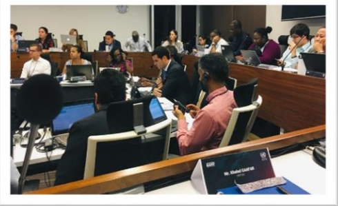
Participants in UNCTAD's regional course on Key Issues on the International Economic Agenda

UNCTAD's 42nd Regional Course on Key Issues on the International Economic Agenda (Para. 166) took place in Medellin, Colombia from 29 July to 2 August 2019. The sessions on business linkages, entrepreneurship and SME development were well received by the 26 participants, representing 12 Latin American and Caribbean countries, who attended the course hosted at the University EAFIT, Medellin. The participants gave feedback at the end of the module, highlighting the need to better understand connections and interdependence between different policies and their impact on national economic growth and development.