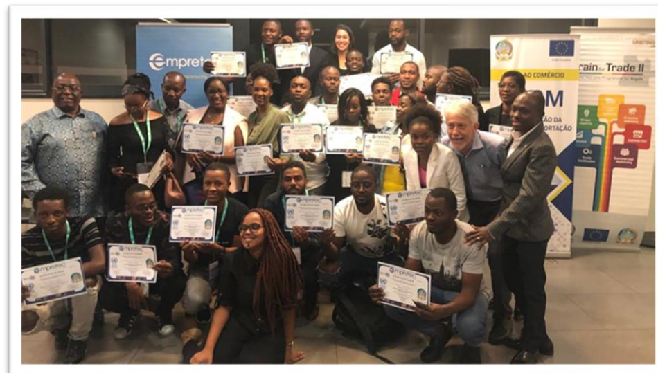
Participants and trainers at the end of ETW No. 6 in June 2019 (Luanda, Angola)

As part of the training activities under the joint EU-UNCTAD Programme of Support for Angola: Train for Trade II, UNCTAD organized, in collaboration with the Angolan Ministry of Commerce, three Entrepreneurship Training Workshops (ETW), which are at the core of UNCTAD's Empretec capacity-building programme in the country.