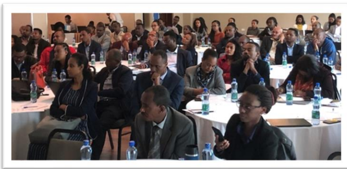
National Entrepreneurship Strategy workshop in Addis Ababa, 23-24 July 2019