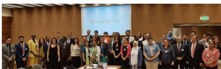
Participants at the conclusion of the Expert Meeting on Investment, Innovation and Entrepreneurship for Productive Capacity-building and Sustainable Development on 19 June 2019 at the United Nations Office in Geneva.

The seventh session of the Multi-year Expert Meeting on Investment, Innovation and Entrepreneurship for Productive Capacity-building and Sustainable Development was held at the Palais des Nations in Geneva, Switzerland from 17 to 19 June 2019. More than 100 experts from the government, academia, NGOs and private companies attended a three-day event. The meeting discussed inclusive policies that facilitate entrepreneurship especially amongst typically economically disadvantaged groups such as women, youth and migrants, as well as facilitated sharing of good practices and challenges on promoting inclusive business models and corporate social responsibility.