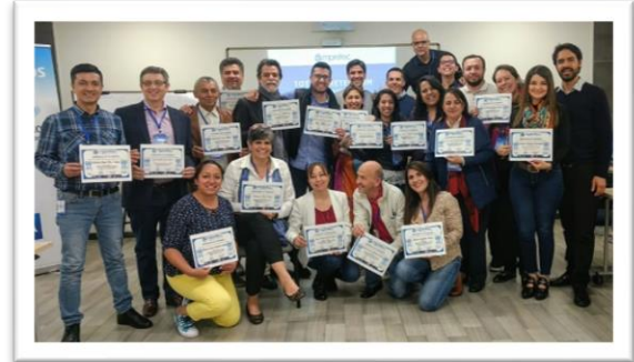
Empretec TOT workshop participants at Cafam (Bogota, Colombia)