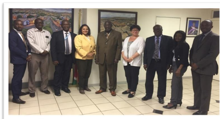
Hon. Tjekero Tweya, MP and Minister of Ministry of Industrialization, Trade and SME Development with representatives of UNCTAD, UNDP Namibia, Empretec Ghana Foundation and members of the Ministry Empretec team during project implementation meeting held at the Ministry on 22 August 2019