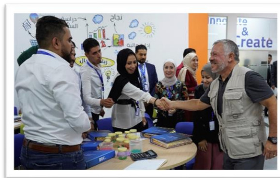
His Majesty King Abdullah of Jordan shakes hands with participants in the Ajloun Business Incubator, which works with young entrepreneurs and supports small- and medium-sized enterprises in Jordan

The launch of the incubator was part of the Royal initiatives upon His Majesty's directives and vision and aims to help the Jordanian youth around the kingdom get acquainted with entrepreneurship. The youth will be introduced to financial, marketing, and business linkages skills, with an ultimate objective to become job-creators rather than job-seekers.