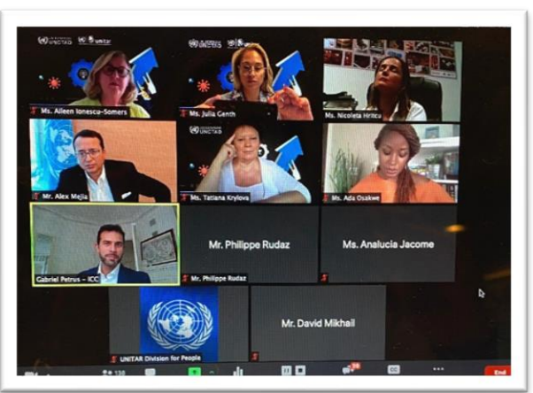
UNCTAD-UNITAR joint webinar on the role of Entrepreneurship in post COVID 19 Resurgence held on 18 September 2020.

The first Virtual Roundtable took place on 18 September 2020 and was attended by about 180 online participants. During the animated discussions, entrepreneurs, policy makers, academics and practitioners shared their views and experiences on the challenges and opportunities entrepreneurs face in the current global crisis.