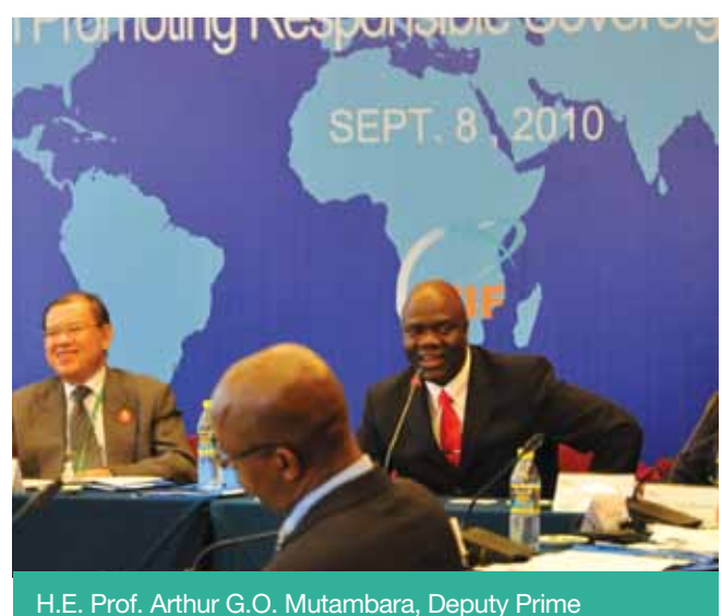
Minister of Zimbabwe, addressing the Conference on Promoting Responsible Sovereign Lending and Borrowing.

No universally agreed principles for responsible sovereign lending and borrowing currently exist and officials expressed support for the continued work of this initiative.