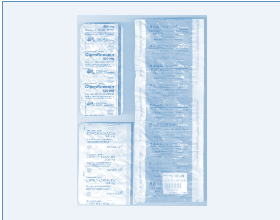
Figure 1 Branded and nonbranded versions of the same medicine are sold at significantly different prices in Indonesia

When tabulated by composition of the market (Figure 2), Indonesia is typical of evolving markets, with high local generic activity in low-value therapeutic areas. The top local manufacturers, such as Kalbe Farma (the largest pharmaceutical firm in South-East Asia), Sanbe and Dexa, typically have large portfolios and are present across many therapeutic areas. The leading area continues to be anti-infectives (23% by value), with gastrointestinal drugs second (20% by value) and cardiovascular drugs third (13% by value). However, not many of the Japanese companies are present in the antibiotic segment.