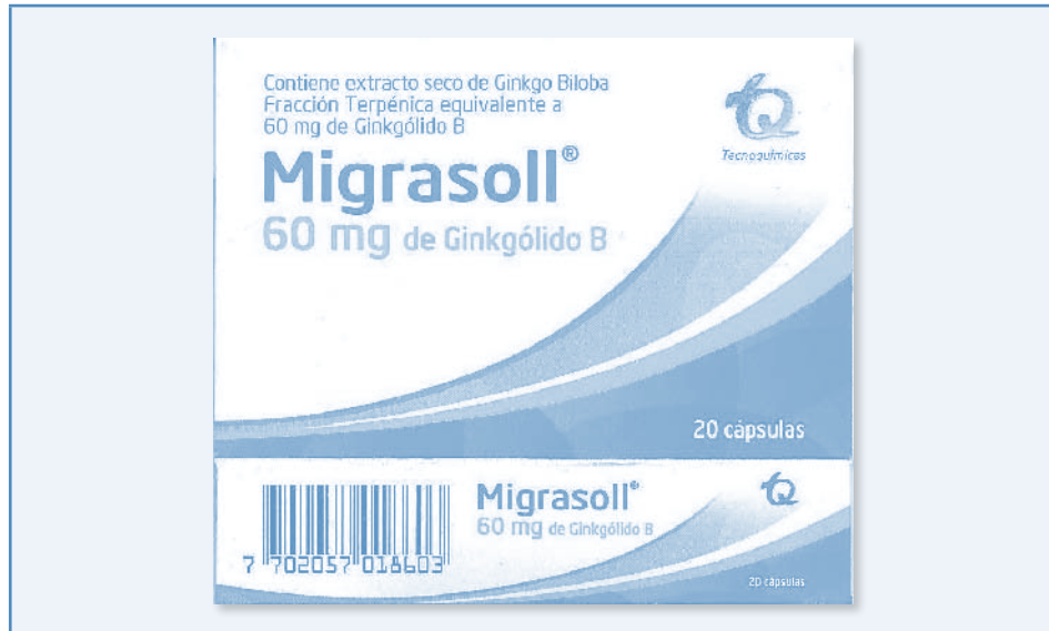
Figure 1 MK generic product package

Figure 2 shows a package of a branded generic product distributed by Tecnoquímicas. Annex III to this case study shows the branded generics line and the corresponding therapeutic groups.