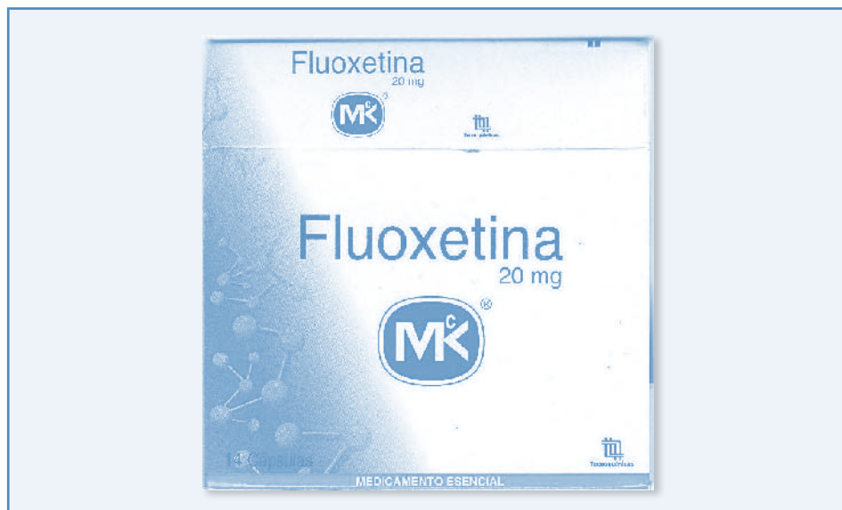
Figure 2 Branded generic package distributed by Tecnoquímicas

Tecnoquímicas and its subsidiaries have eight manufacturing plants in Colombia. The company manufactures 87% of the products it sells. It handles about 5000 raw materials and manufactures about 2800 different finished