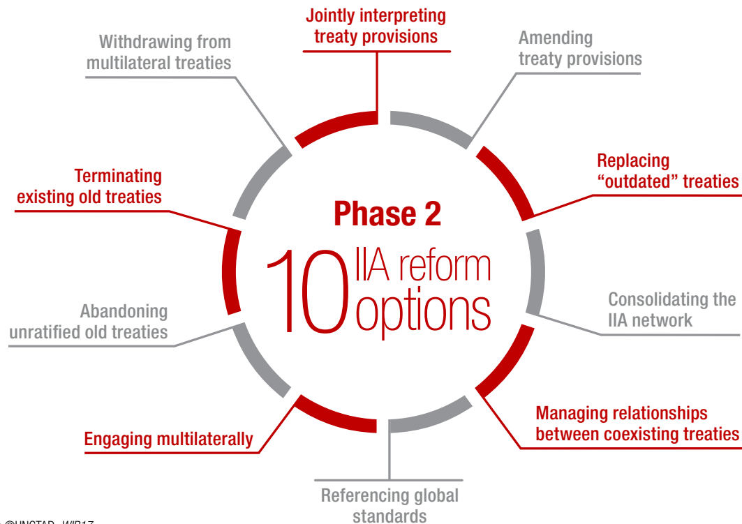
Figure 2. Phase 2 of IIA Reform: 10 Policy Options

The WIR17 also called for a move to Phase 2 of IIA reform: modernizing the existing stock of older-generation treaties. Old treaties abound: more than 2,500 IIAs in force today (95 percent of all treaties in force) were concluded before 2010. Old treaties bite: virtually all known ISDS cases have been based on those treaties. And, old treaties perpetuate inconsistencies. In the WIR17, UNCTAD then presented and analysed the pros and cons of 10 Policy Options for Phase 2 of IIA reform (figure 2).