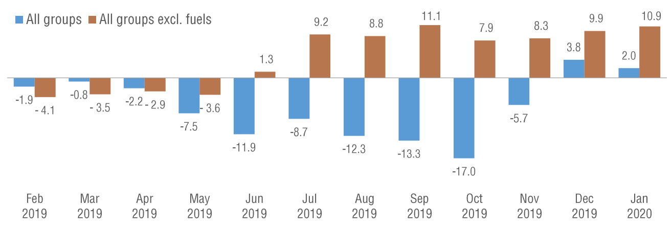
Figure 1. FMCPI growth rate (Year-on-year percentage changes)

The FMCPI excluding fuels has increased continuously, year-on-year, since the second half of 2019. In January, this increase was 10.9 per cent (see figure 1). The month-on-month gain was 2.7 per cent.