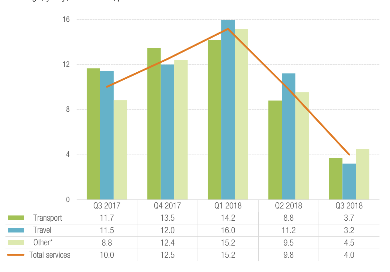
Figure 1. Services global exports growth rate (Percentage, y-o-y, current US$)

Global services exports growth Q3 2018 + 4^{\circ}/_{\circ}