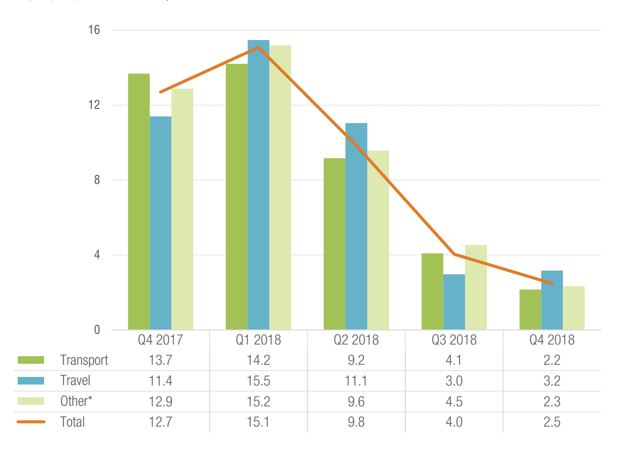
Figure 1. Global services exports growth rate (Percentage, y-o-y, current US$)

Global services exports growth Q4 2018 + 2.5%