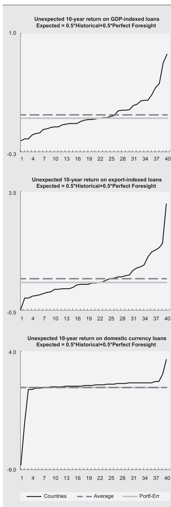
Figure 2 UNEXPECTED 10-YEAR RETURN

More importantly, the cumulated returns on the MDBs' portfolios of the three types of loans provide interesting evidence on the potential gains or losses that could result from loan indexation, while the returns on individual loans are suggestive of the insurance that countries could obtain. Table 6 shows, in the first row, that the 10-year return on the portfolio of GDP-indexed loans is 7.1 per cent, while the returns on individual loans vary from a minimum of -17.4 per cent to a maximum of 76.9 per cent. The 10-year return on the portfolio of export-indexed loans, reported in the second row, is as high as 44.0 per cent while the range of individual loan returns