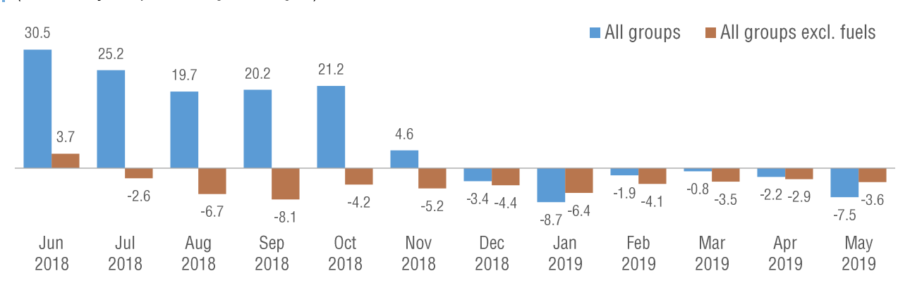
Figure 1. FMCPI growth rate (Year-on-year percentage changes)

The FCMPI of "all groups excluding fuels" slightly decreased by 1.2% month-on-month. It was 3.6 per cent lower in May 2019 than in May 2018 (see figure 1).