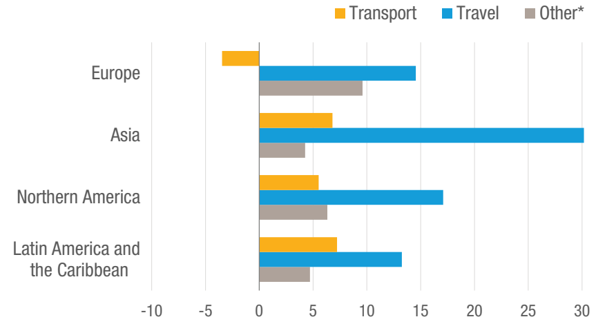
Figure 3 Services exports growth rates by region, Q1 2024, YoY Percentage change year-on-year