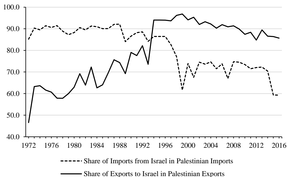
Figure 2 Share of Israel in Palestinian international trade (Percentage)

17. The restrictions on Palestinian trade establish substantial non-tariff barriers and divert Palestinian trade from competitive world markets to the less favourable Israeli markets at significant cost to Palestinian producers and consumers. Imports of the Occupied Palestinian Territory from Israel are dominated by goods for which Israel does not have a particular comparative advantage in exporting; this means they can be procured at lesser cost from other markets. Even when trading with third countries, Palestinian traders are often forced to access foreign markets through Israeli intermediaries, an arrangement that drains away Palestinian economic resources. The degree of trade diversion is reflected in that, between 1972 and 2017, Israel absorbed 79 per cent of total Palestinian exports and 81 per cent of imports. Trade concentration with Israel, as depicted in figure 2, mirrors the isolation of the Occupied Palestinian Territory from global markets.