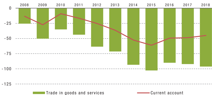
Figure 2 Balances in least developed countries' current accounts (Billions of United States dollars)

The current account surplus in developed economies, which had emerged in 2015, stood at US$99 billion in 2018; half of the amount recorded in 2017. This decrease was driven by increasing imports of goods, relative to exports.