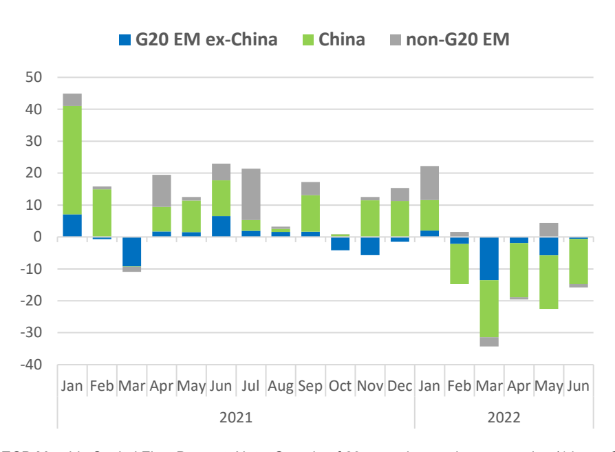
Figure 3. Portfolio debt inflows to emerging markets (USD bln)

OECD data point to substantial and uninterrupted portfolio (debt) outflows from emerging markets (EMs) between February and June 2022 (latest month available). Emerging markets recorded cumulative portfolio outflows of USD 120 billion during the course of these five months – a greater volume than the dramatic but shorter-lived outflows of March and April 2020 at the height of the COVID-19 pandemic. Such outflows were seen mainly from P.R. China, but have also affected other G20 emerging market economies as well as non-G20 emerging economies (Figure 3).