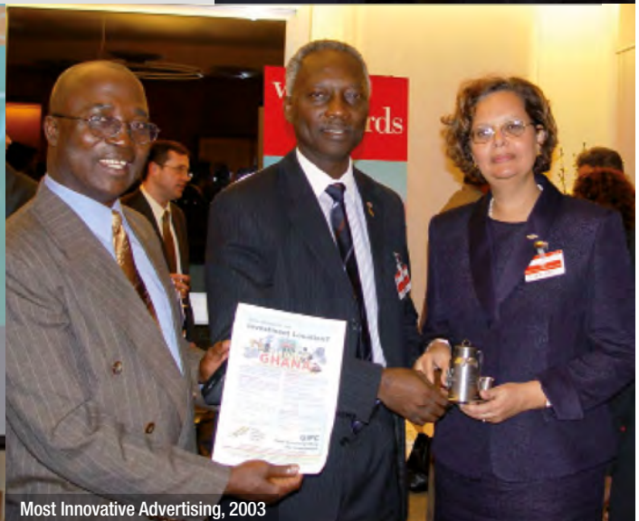
Most Innovative Advertising, 2003