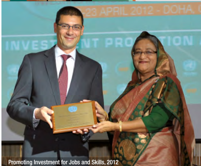
Promoting Investment for Jobs and Skills, 2012