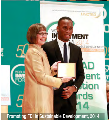
Promoting FDI in Sustainable Development, 2014

Since 2002, 48 UNCTAD Investment Promotion Awards have been presented for excellence in a variety of areas.