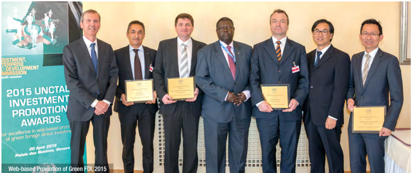
Web-based Promotion of Green FDI, 2015