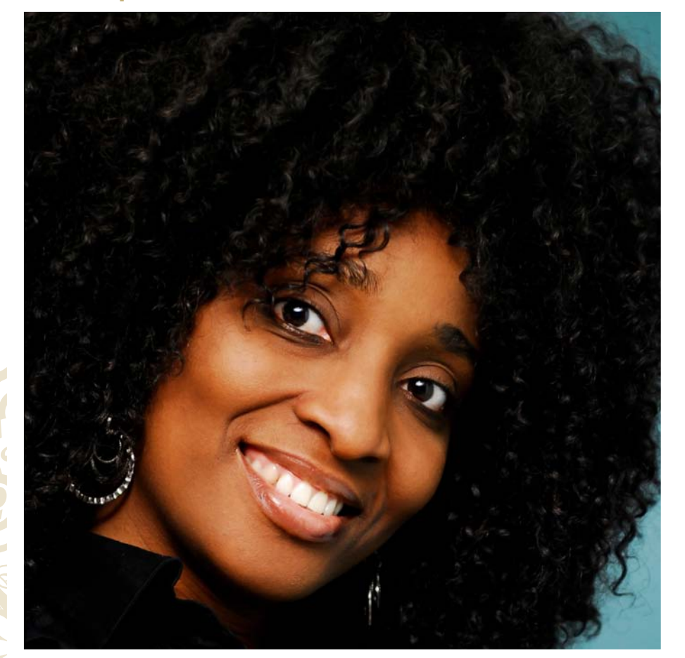
No Surprises Ltd. - NIGERIA