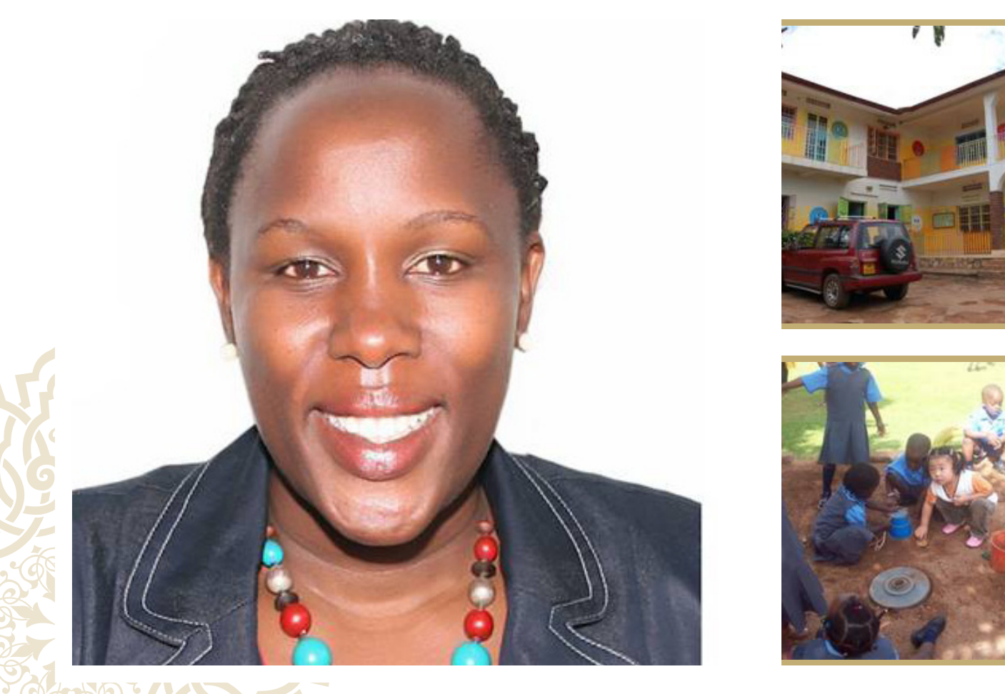
KinderKare Pre-School - UGANDA

66 Our mission is to provide high-quality child care and education in a safe, clean, and secure