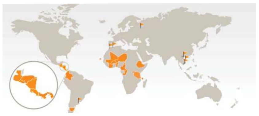
The eRegulation site in Benin