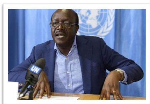
Dr. Mukhisa Kituyi tweets in support of small businesses on the occasion of the MSME day, 25 June 2020.