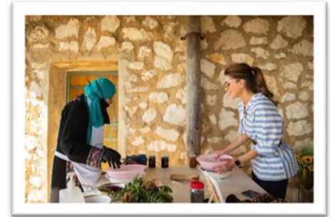
Queen Rania Al Abdullah visits the Empretec graduate’s restaurant in the governorate of Ajloun.