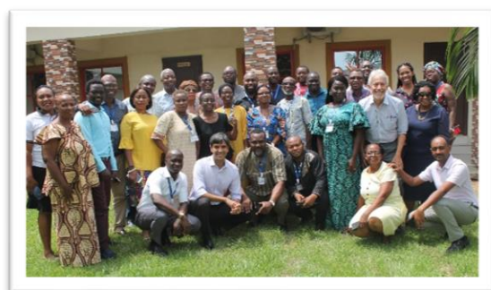
Empretec Master Class graduates in Lagos, Nigeria on 22 February 2020.

Empretec Master Class (ETW) and the Empretec Training of Trainers (TOT) workshops took place in Lagos, Nigeria from February 17 to 22, and 24 to 28, 2020, respectively. The two events were organized jointly by UNCTAD and the Empretec Nigeria Foundation to introduce a revised ETW curriculum, which was elaborated by UNCTAD and SABRAE/Empretec Brazil, based on research and testing workshops carried out in different continents to reflect present day international best practices in business training delivery methods.