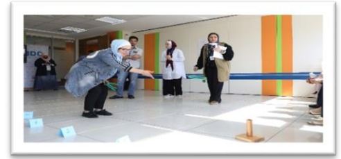
Jordanian Business Development Center-BDC expands its Empretec Program to reach more youth in vulnerable areas of Jordan.

To find out more about ‘Boost with Facebook,’ or to enquire about registration for future online sessions, please visit: https://www.facebook.com/BDCjo/ .