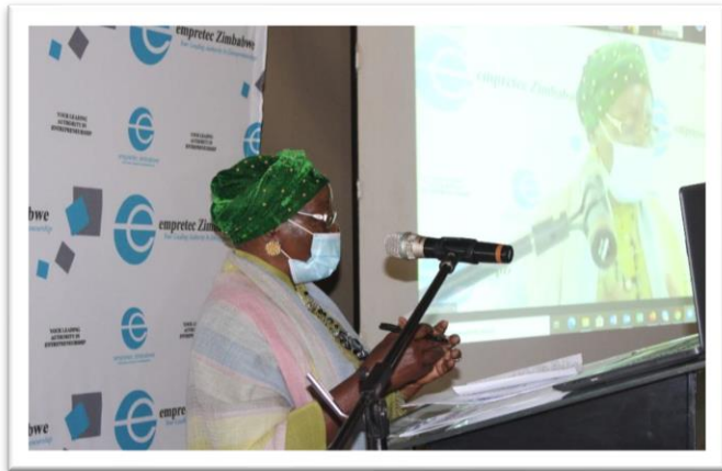
Minister of Women Affairs, Community, Small & Medium Enterprise Development - Honourable Dr. S.G. Nyoni addresses EPF Zimbabwe webinar panel on 18 June 2020.

Empretec Zimbabwe, working jointly with the Ministry of Women Affairs, Community, Small & Medium Enterprises Development, and in partnership with UNCTAD and AFFORD UK, organized a webinar on 18 June 2020 to discuss opportunities and constraints to sustainable entrepreneurship in Zimbabwe. The virtual gathering sought to have different members of the entrepreneurship ecosystem in the Zimbabwe come together to deliberate on the key environmental issues affecting them.