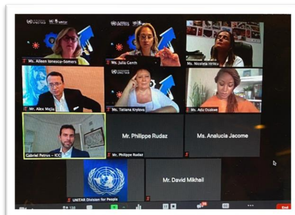
UNCTAD-UNITAR joint webinar on the role of Entrepreneurship in post COVID 19 Resurgence held on 18 September 2020.

https://infogram.com/1prdz6xmyk9e79tgq299prwrr7cmv65v3xp?live